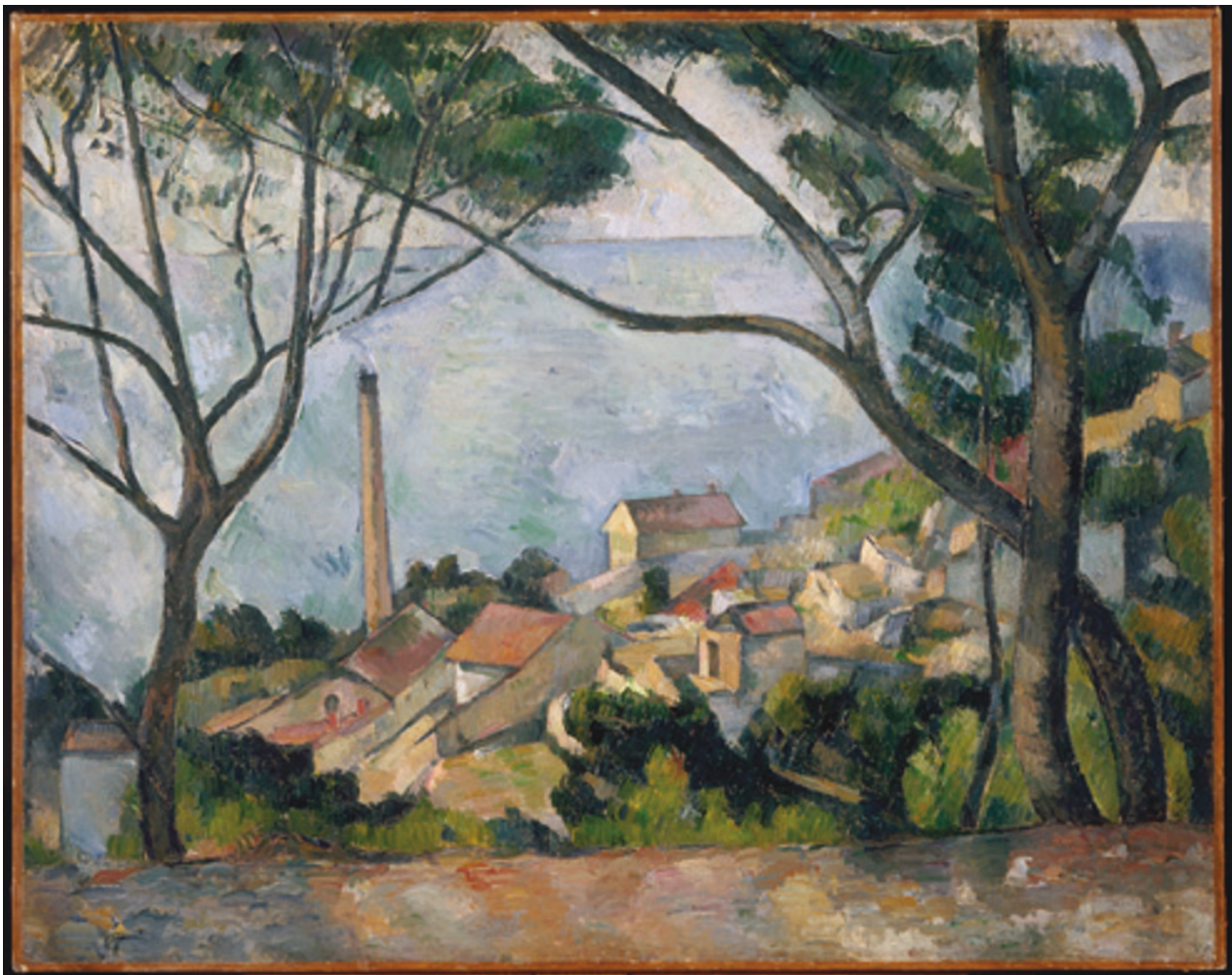
Figure 1. Beyond qualitative imaging. In Paul Cézanne's 'La mer à l'Estaque', trees can easily be recognized in the foreground. Nevertheless, a closer look reveals that the dimensions and geometry of the branches are not realistic at all, illustrating the relative weakness of the human eye and how a qualitative observation can lead to misleading conclusions.